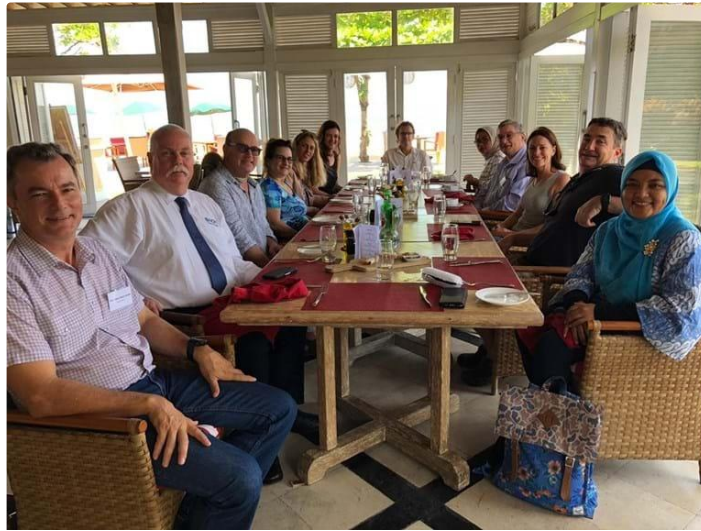
NAR Committee Luncheon

Back to the beginning of the International Update