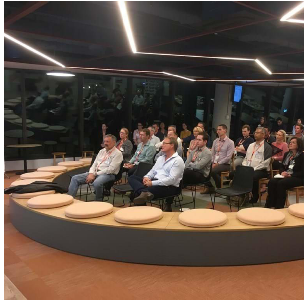
Attentive Queensland South members

Back to the beginning of the Regional Update