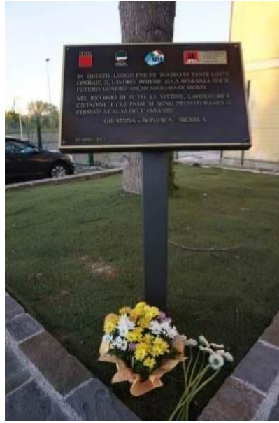
A memorial to the asbestos victims in the ETERNOT community parkland with flowers laid by AIOH members