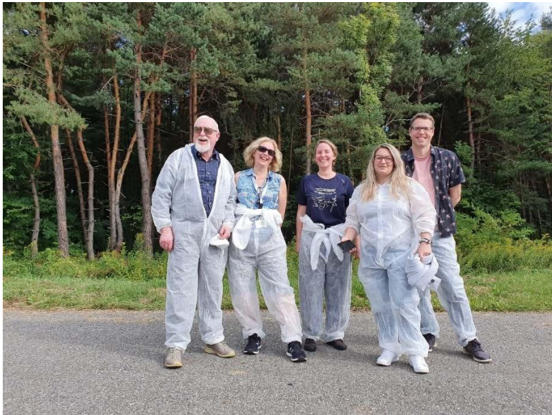
AIOH members at the Balangero mine tour