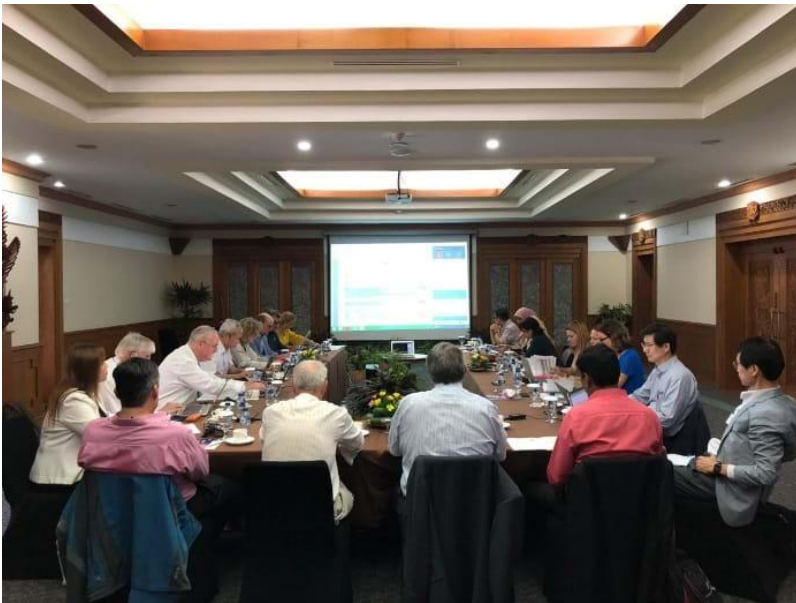
IOHA Board Meeting