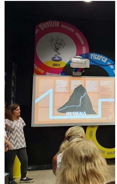
High school students delivering their innovative

Back to the beginning of the International Update